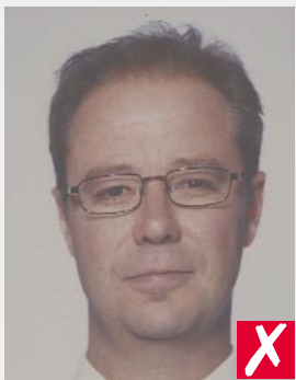
washed out colour